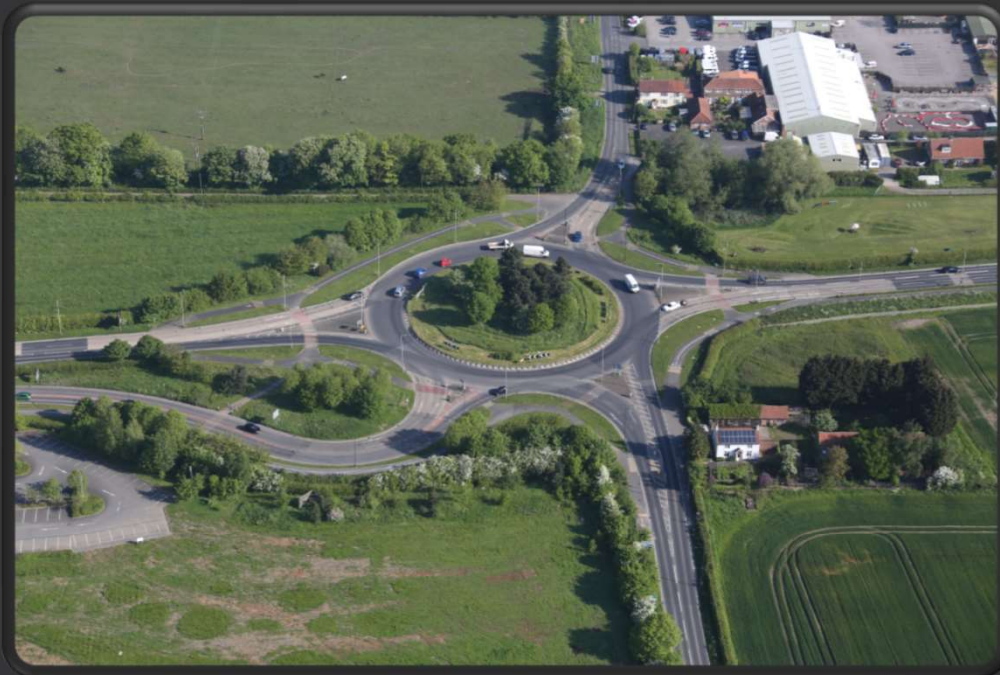
Wigginton Road Roundabout May 2018