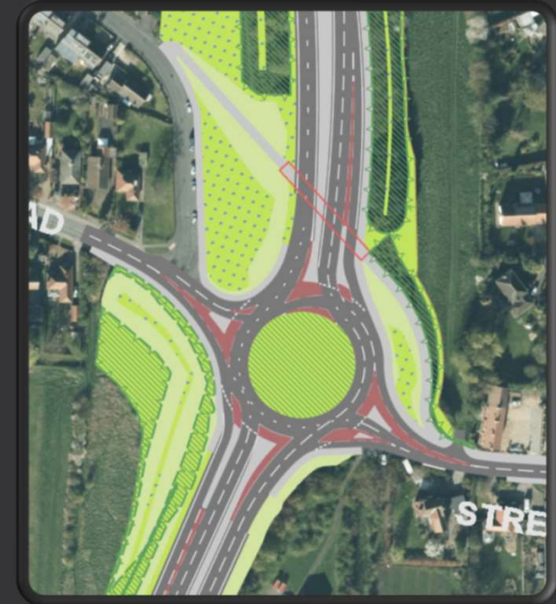
Strensall Road Roundabout – Proposed Works