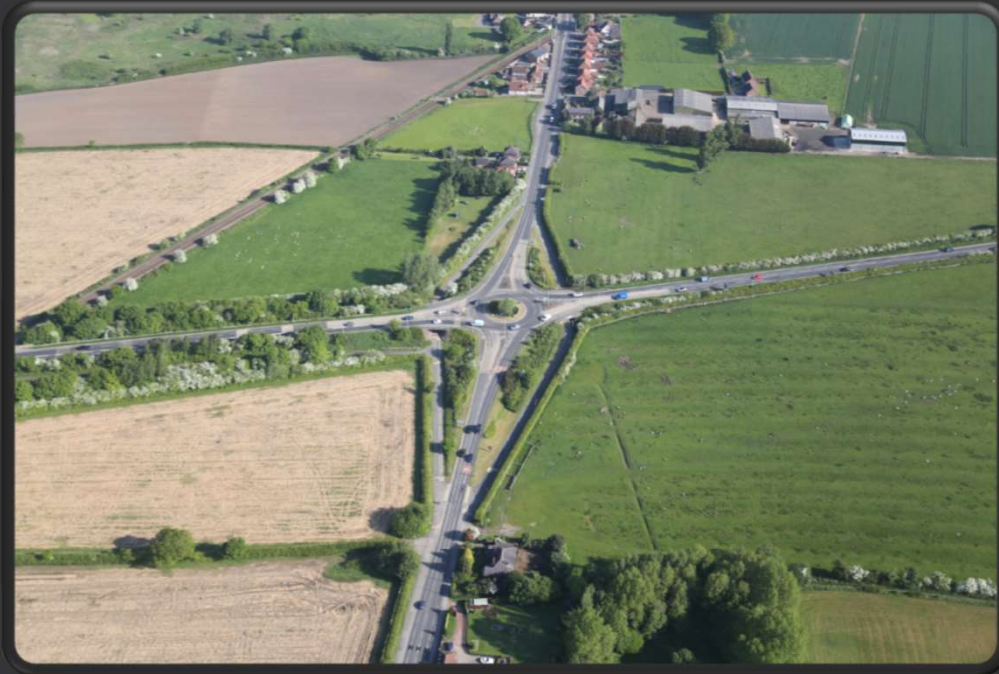
Haxby Road Roundabout May 2018